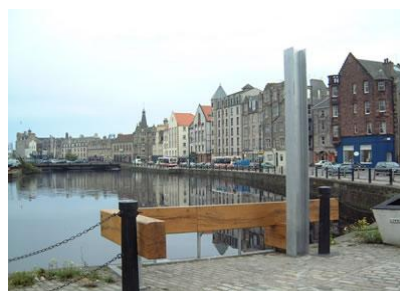
The bars of Leith