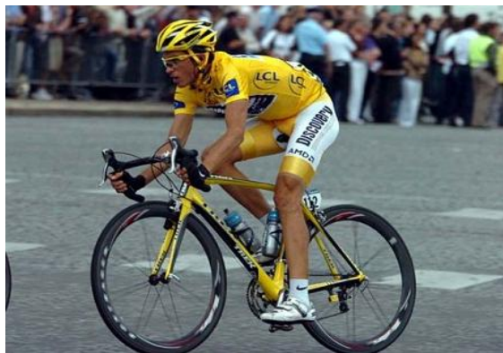
Alberto Contador on his bicycle