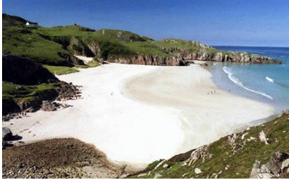
Pocket Beach - Durness

urness and head down the north west coast on the A838 and in where we take the A835 onto the bustling port of Ullapool. we then sweep past Loch Broom and squeeze through the Corrieshalloch Gorge, by-passing Ben Wyvis before head into either Inverness or Drumnadrochit, where we will collapse for the night.