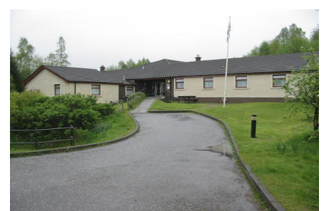
Crianlarich Youth Hostel